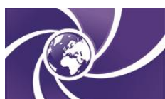
INTERNATIONAL ASSOCIATION OF ART PHOTOGRAPHERS