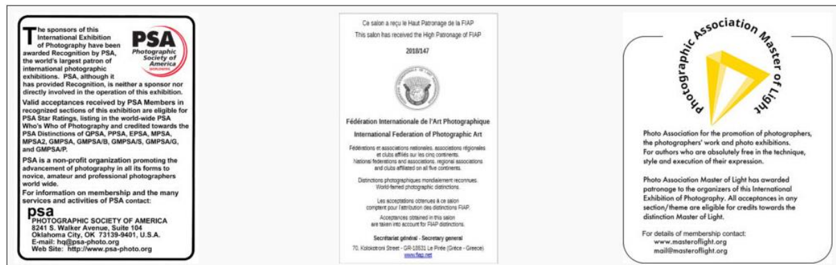
PSA 2021- xxx

Summer, Sea, Sun 2021 International Exhibition of Art Photography is organized by the Krk Photo Club from Croatia.